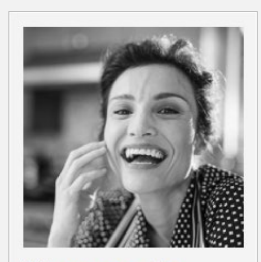
Welcome to your plan

Help your employees get started with their health plan using B'link employee communications. The Welcome to Your Plan category features materials that will help your employees: