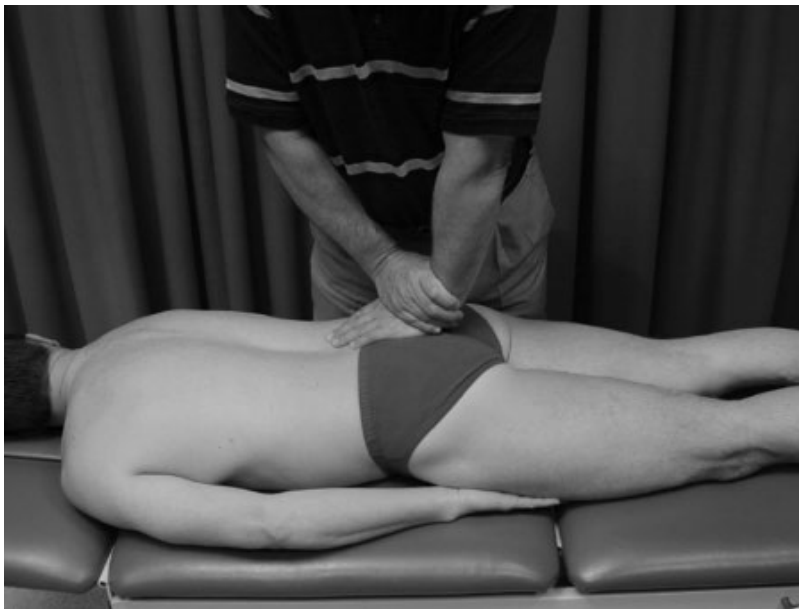
Figure 5 – Sacral thrust test

The sacral thrust test (testing right and left SIJ simultaneously).