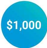
55+ catch-up payment